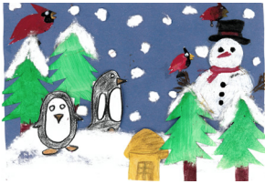
1st Place Ashir Arsalan, Terrace Elementary